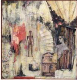
"Do I Hear a Chain Saw" (14" x 12")